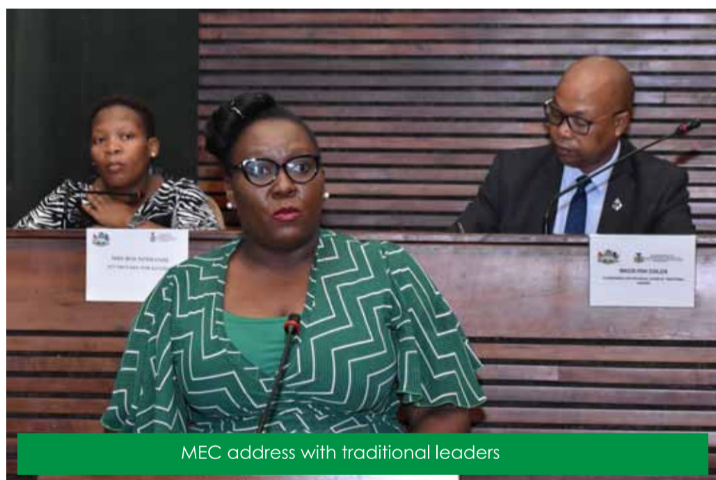
MEC address with traditional leaders