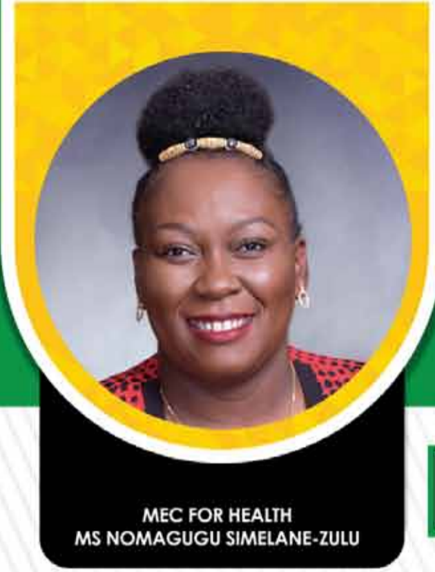
MEC FOR HEALTH MS NOMAGUGU SIMELANE-ZULU

health Department: Health PROVINCE OF KWAZULU-NATAL