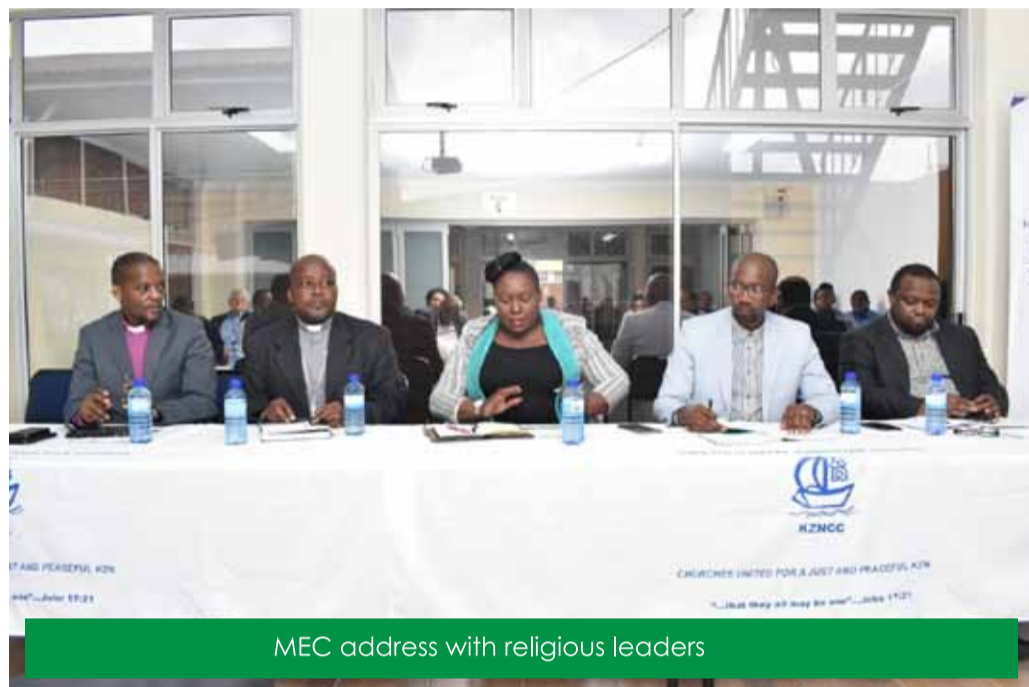
MEC address with religious leaders