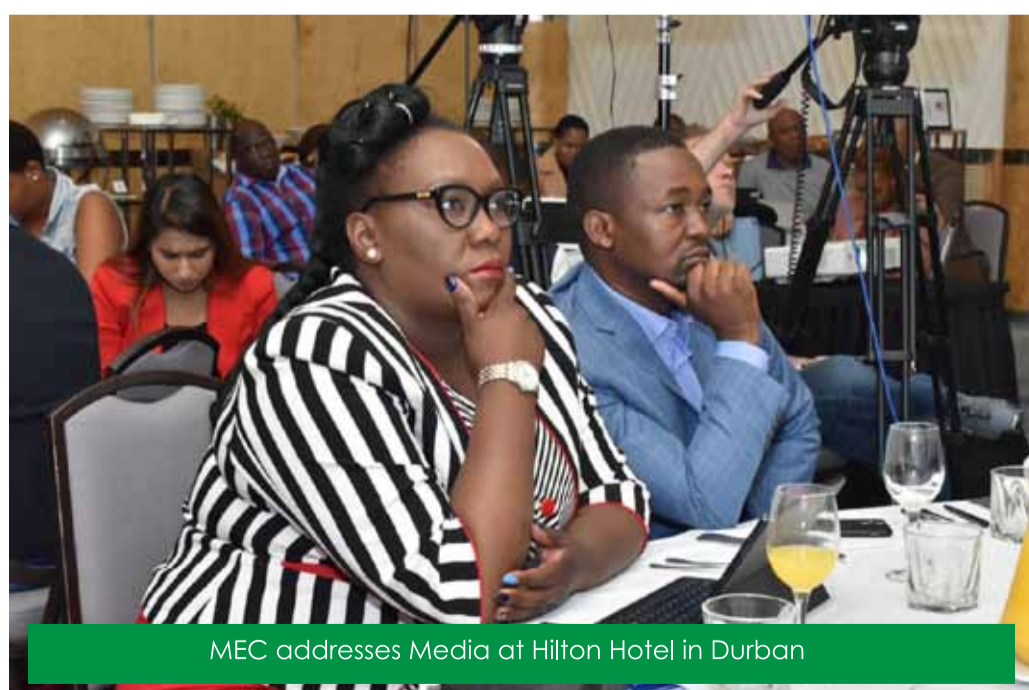
MEC addresses Media at Hilton Hotel in Durban