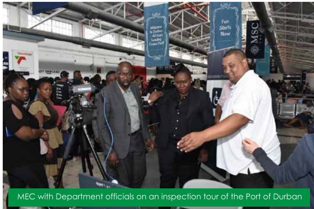
MEC with Department officials on an inspection tour of the Port of Durban