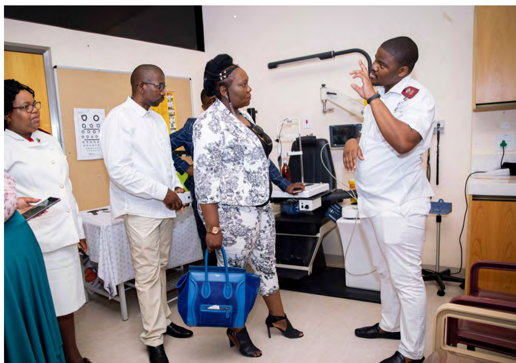
continued on page 11 >>>