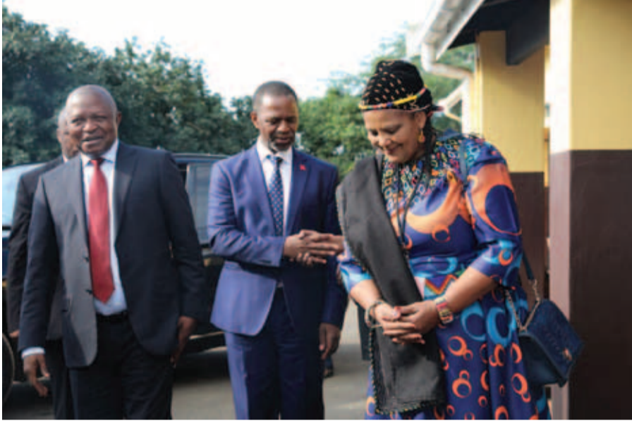
TB PREVENTION CAMPAIGN LAUNCH @JL DUBE STADIUM, INANDA →