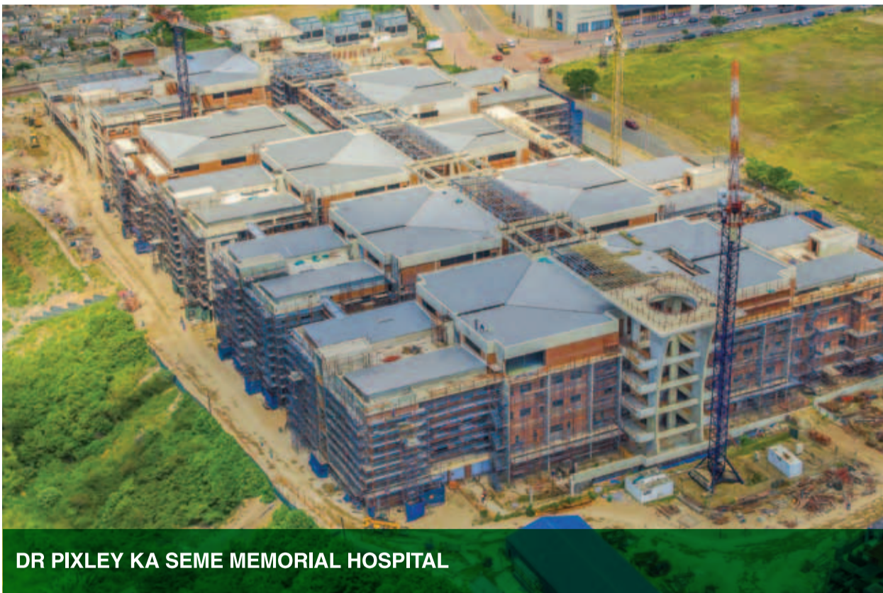
DR PIXLEY KA SEME MEMORIAL HOSPITAL