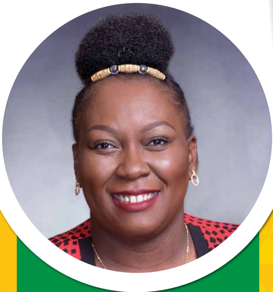
MEC FOR HEALTH MS NOMAGUGU SIMELANE-ZULU

health Department: Health PROVINCE OF KWAZULU-NATAL