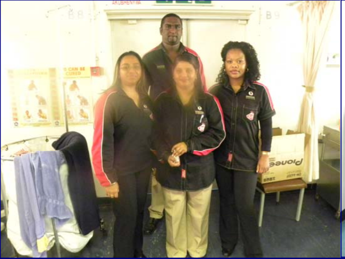
THE HIFI CORPORATION