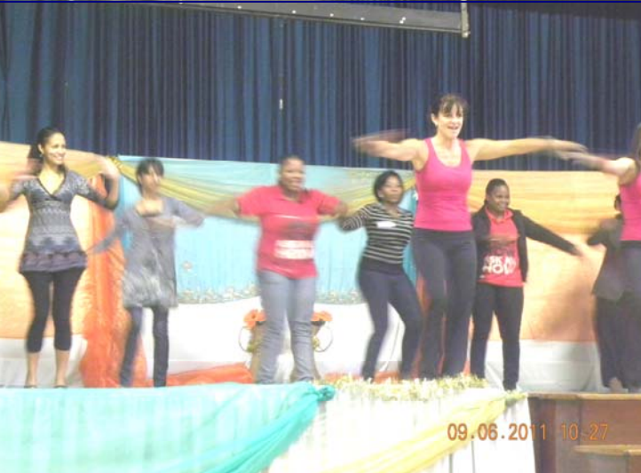
VIRGIN ACTIVE DEMONSTRATING