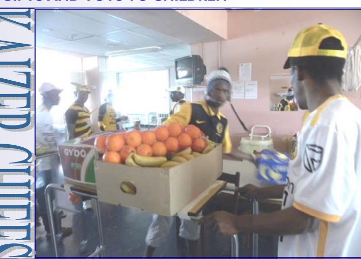
THE KAIZER CHIEFS FANS OFFERING GIFTS TO CHILDREN