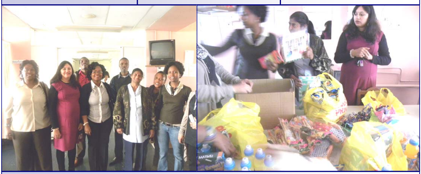
ETHEKWINI WATER AFFAIRS DEPARTMENT

This contribution is has positive response to the ailing kids. Such kids become better in a short span of time and it is well received by parents.