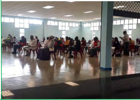
Nquthu JOC Operation 1st Meeting