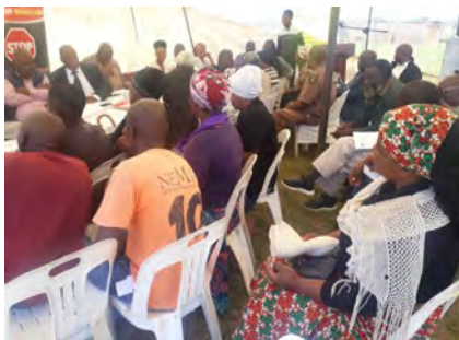
Substance Abuse & Teenage Pregnancy. ON PAGE 1

COMMUNITY MEMBERS WHO HAVE ATTENDEND CRIME, SUBSTANCE ABUSE AND TEENAGE PREGNANCY HELD AT SCELIMFUNDO HIGH