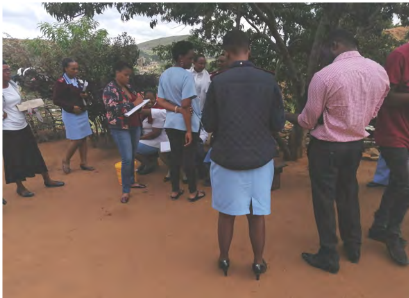
The team from CJM Hospital engaging on “Nqo-nqo-Sikhulekile Ekhaya” initiative conducted at Ncepheni Area in Ward 01.

During this visit a comprehensive health care screening was done to seven households and 16 people were screened