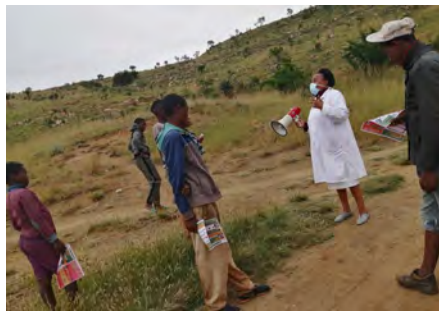
Loud Hailing for COVID-19... READ MORE ON PAGE 02