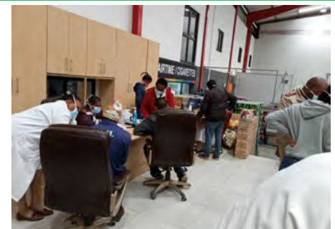
Covid-19 screening at a Phoenix Supermarket