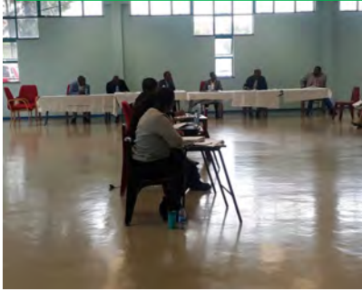
Nquthu JOC Operation 2nd Meeting .