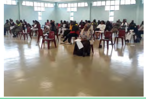
Nquthu JOC Operation 2nd Meeting