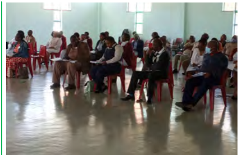
Establishment of Nquthu JOC... READ MORE ON PAGE 2