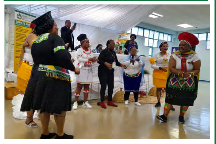
Surgical ward staff performing traditional dance during COVID-19 thanks-giving and heritage day cerebration.