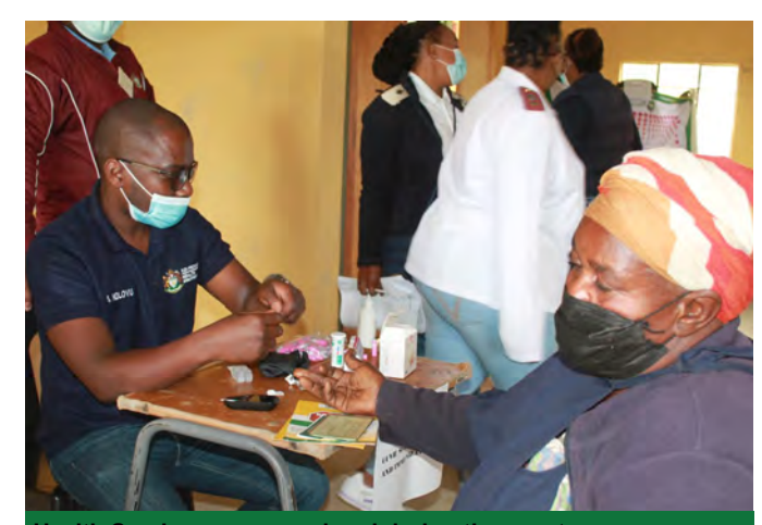
Health Services were rendered during the event.