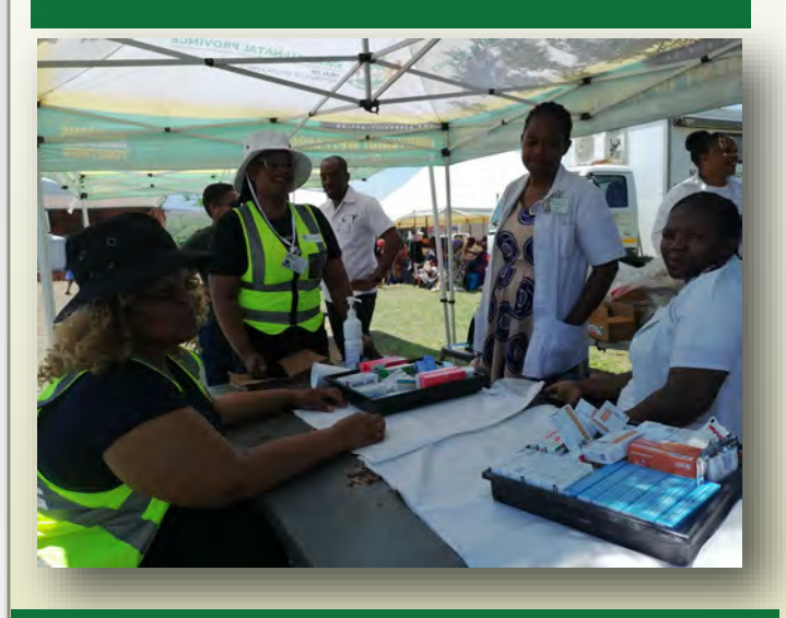
Above: Pharmacy department patiently waiting to dispense much needed medication.