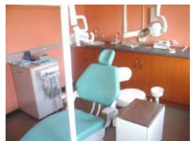
Igumbi lokusebenzela seliphelile kanye nemishini yokusebenza emisha.