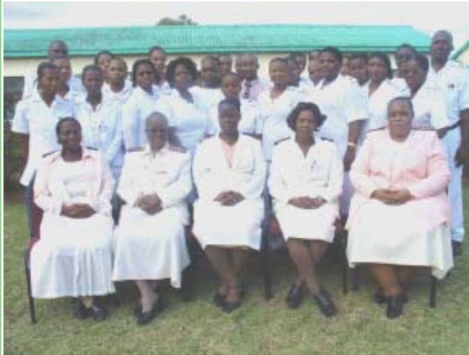
GROUP 4/2006 with their Tutors and the Principal of the Nursing school.

The group of 26 candidates benefited the following from this learnership: