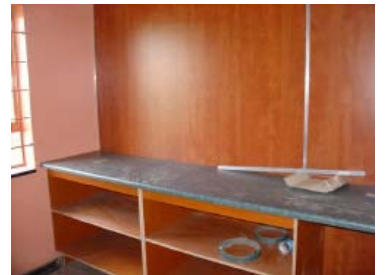
Kuqala nqa ukulungiswa...

Ezinye izinqimamba ebezikhona esibhedlela sakwaCeza ukushoda kodokotela. Namhlanje umphakathi wakwaCeza usuhleka wodwa ngoba abasalindi isikhathi eside belinde udokotela. Osekuyisibusiso esikhulu manje ukuthi odokotela sebevakashela nemitholampilo ngezinsuku ezithile.