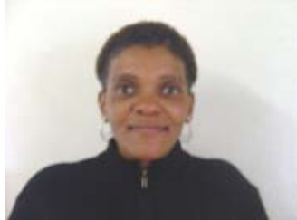
M; Z.B. Zulu Supply Officer