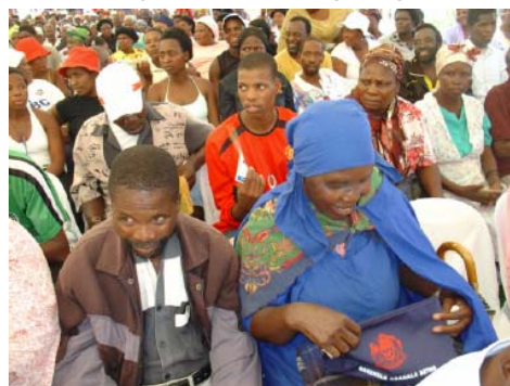
It was time for freebies; the community received bags, caps & T-shirts