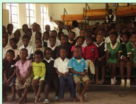
Gonzaga Primary School learners listening