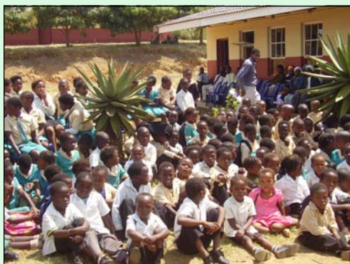
Odado baseNtingwe Combine Primary School belalele abezempilo