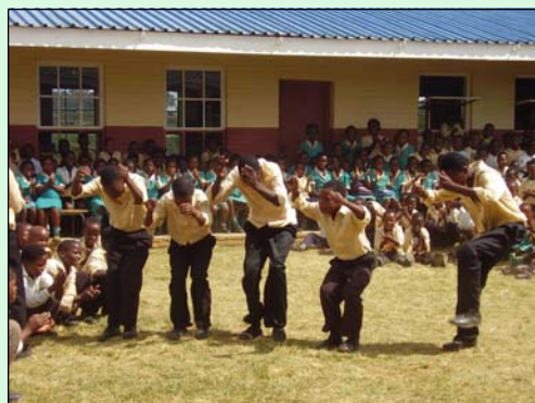
Abafana bengoma bejabulisa izibukeli