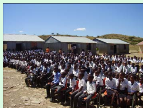
Ngqulu Primary School learners listening attentively