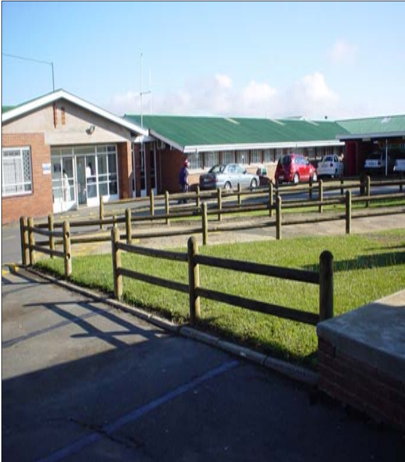
HOSPITAL ADMIN BLOCK NORTH WING