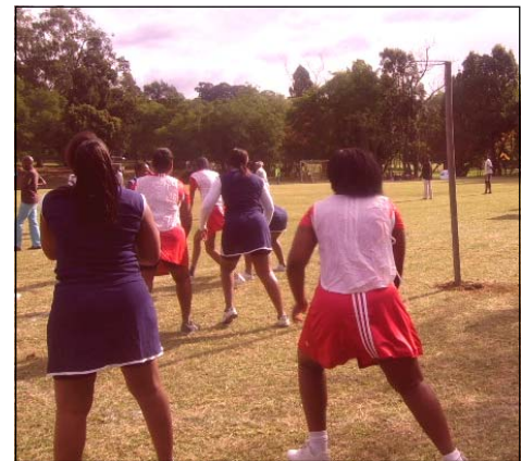
NET BALL IN ACTION WITH APPELS-BOCH AND THEY WON THE GAME BY 20 GOALS TO 8. WAY TO GO GIRLS.....

Nobody can stand firm before us Greytownians!!! and our visitors can confirm that. Professional teams will always be welcome to play with our soccer and netball teams