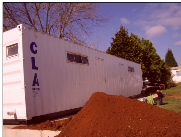
Ablution Container for Tholithemba Clinic

complaint. A big fully functional container