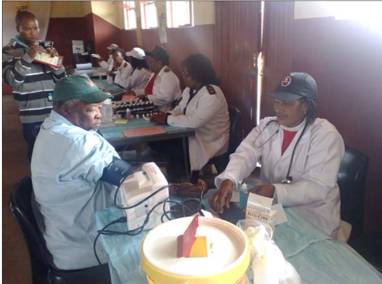
HAST team in action at MBUBA area. Remember this was on Saturday - look at the attendance by staff.

Attendance was good and community members were very happy to see that somebody out there notices that they are in need of health facilities.