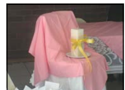
BIG CANDLE FOR THE DAY

May this spirit stay forever within Greytown Family.