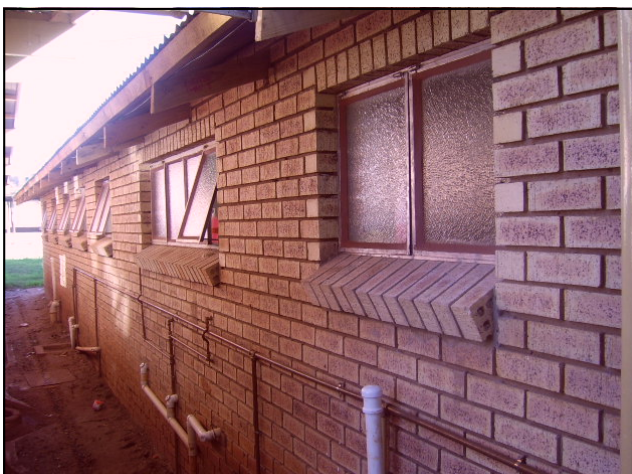
Structure of ablution facility for Male ward extension

complaint. A big fully functional container