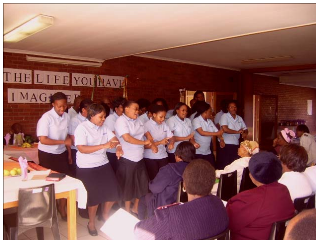
THOLITHEMBA—HAST UNIT TEAM GIVING THE AUDIENCE FOOD FOR THE SOUL. YOU WOULD SWEAR WE HAD PROFESSIONAL CHOIR IN THE HOUSE.