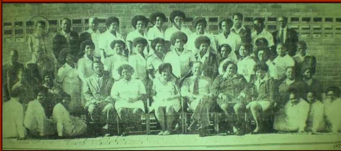
KwaDabeka CHC first staff members 1977