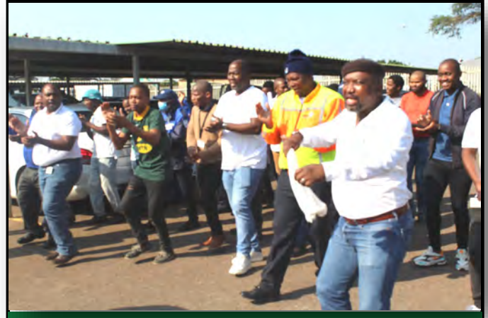
Men were singing during the Isibaya samadoda event celebration, it was a walk to the hall.