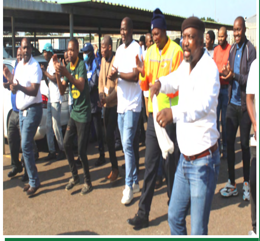
Men were singing during the Isibaya samadoda event celebration At MAHATMA GHANDI MEMORIAL HOSPITAL.

M_{\text{en's}} forum popular known as Isibaya Samadoda was launched at uMzinto on the 9th of November 2007. It's role was to help to create a new order in which men and women are equal members of society, to create a new order in which boy and girl children are raised as equal members of families and to help create communities which not only detest violence against women, children and men, but actively ensure that it does not occur at all in families, communities and the entire country. Also promoting a positive conversation about men, manhood and masculinity. At MAHATMA GHANDI MEMORI-AL HOSPITAL this day was not only celebrated for awareness but also for recognition and celebrating men's positive contributions; to society, community, family, marriage, child care and to the environment.