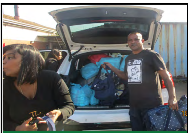
Offloading the car full of gifts from the Teddy up during Mandela day celebration.