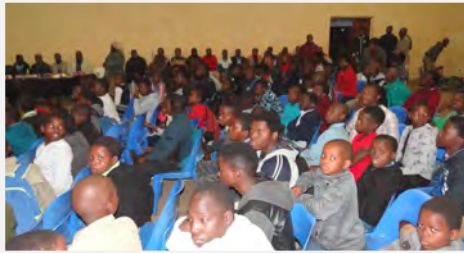
Pic on the left: the boys listening attentively at the main event.