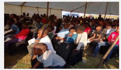
Day 1 proceedings as the boys are screened and getting ready for to settle in for the camp.