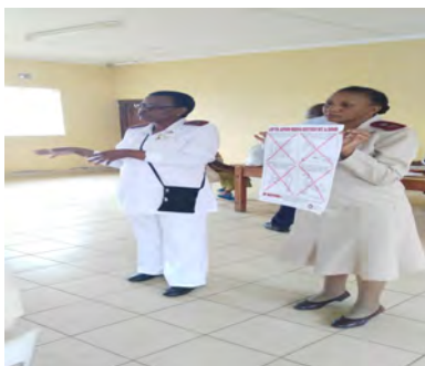
RABIES AWARENESS AND HAND WASH...