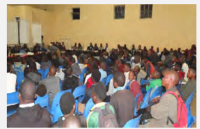
The boys participating in the night activities that were planned for them .