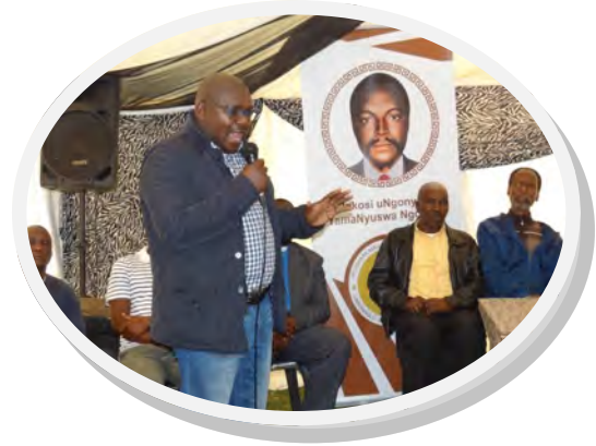
Right : The men & boys who attended the main event