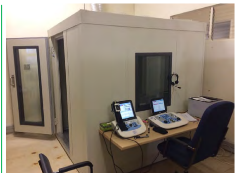
NEW AUDIO BOOTH FOR MONTEBELLO