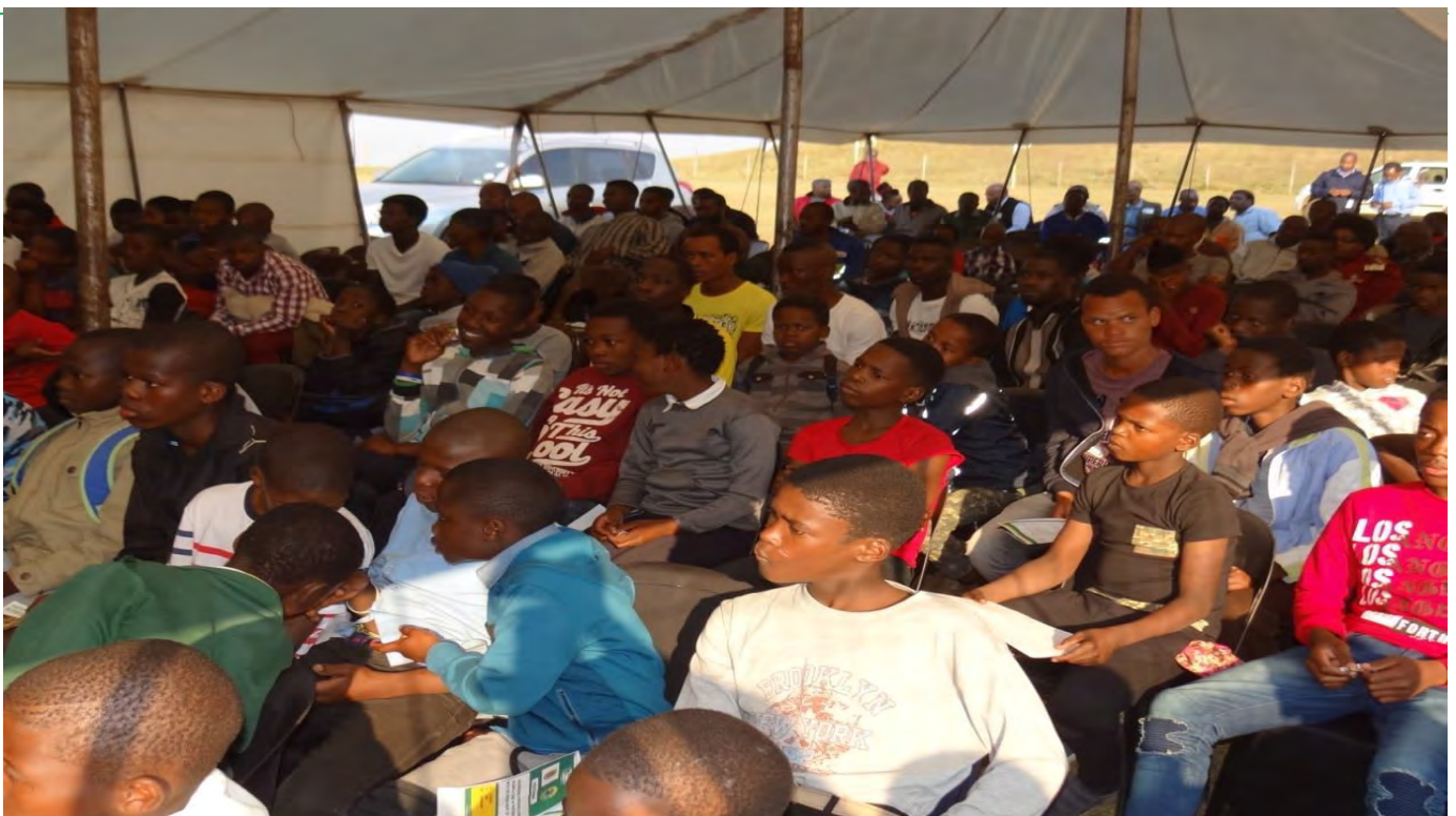
MAIN PIC: At the main event where the boys who were ready to be circumcised were listening attentively to the speakers who were giving them advise on manhood.