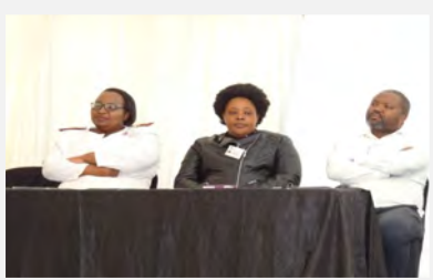
Montebello Hospital Management