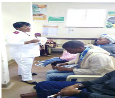
TB AWARENESS DAY ...