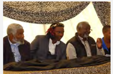
Traditional leadership of Kwamlamula traditional council