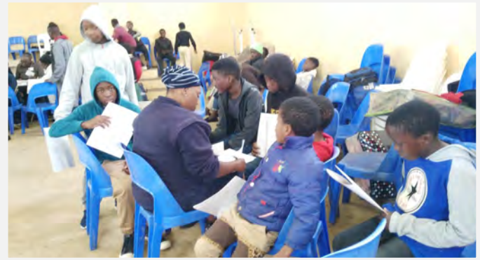
Day 2 proceedings as the boys prepare to be circumcised.