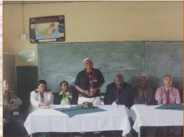
VIP gracing the day.