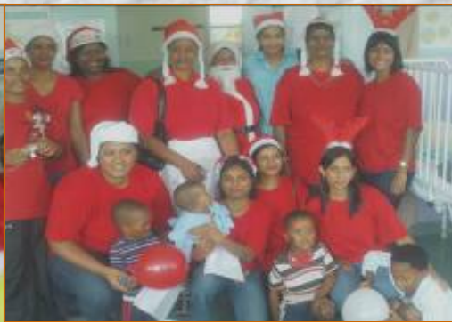
Joy come during Christmas times.