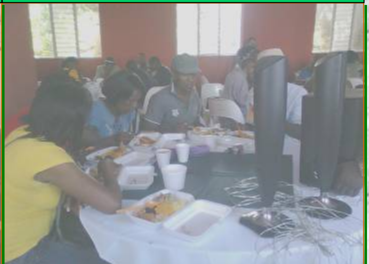
also been there