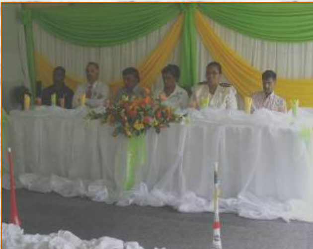
Awarding the awards