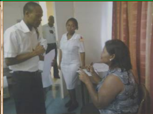
Survey Team in action