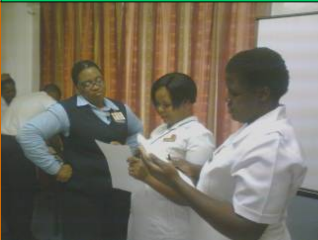
execution of a plan