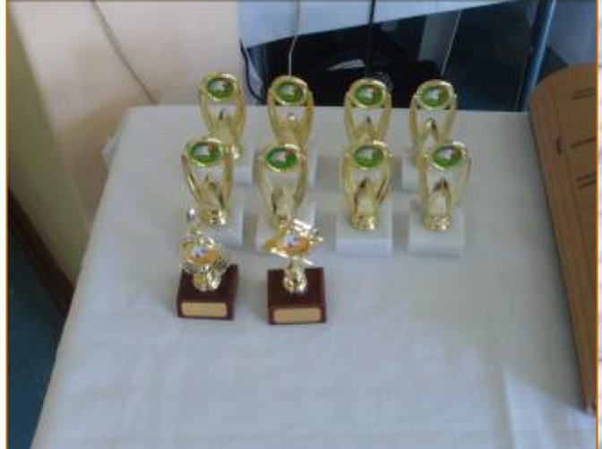
Trophies in display

The facility hosted its 4 th Annual awards presentation on the 12 th November 2010. Staff were presented with 20 years, 30 years long service certificates, Abet students that completed the Abet Level 4 programme were presented with certificates and trophies – some for outstanding achievements, through the Department of Education. Certificates were also presented to staff that excelled through the skills development programme. The Human Resource Department would like to thank all sponsors and staff for their generous support in making this event a success.