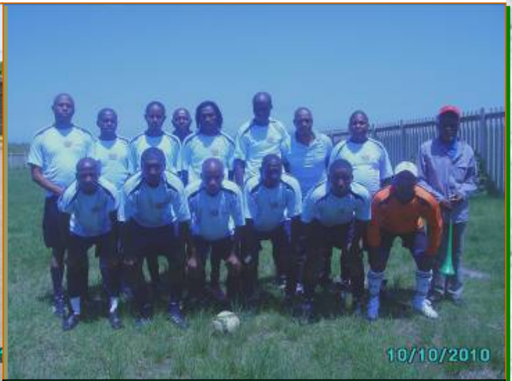
Glamour boys of Taylor Bequest Hospital (Eastern Cape)