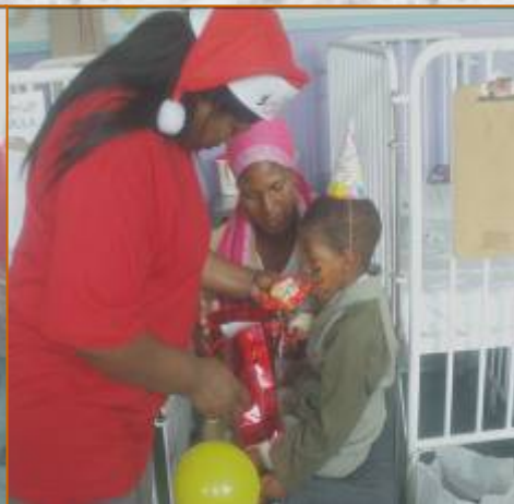
Christmas comes with joy.