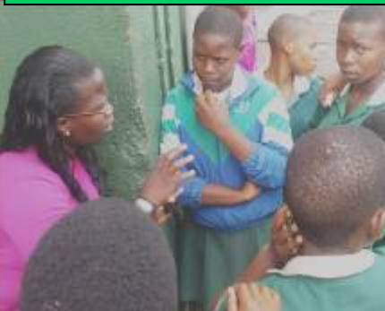
Children giving the listening ear.