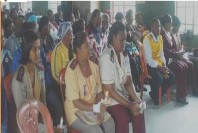
The House at large