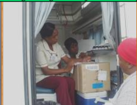
Mobile Clinic in Attendance.

Osindisweni Hospital conducted the World Aids Day at Ogunjini Primary School, on the 3 rd of December 2010.