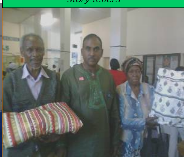
Patients receiving gifts