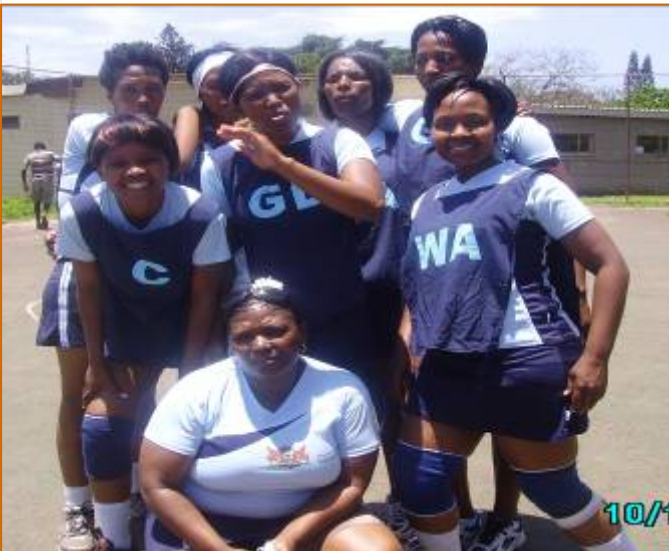
Gladiators of Taylor Bequest Hospital (Eastern Cape)

This is what Taylor Bequest Hospital visitors believe although they were thrashed by Osindisweni Hospital soccer team what they enjoyed the most was the relationship that was built and a wonderful memories that was created with Osindisweni staff. Thumps up to management of both Hospitals for encouraging relationship building of this nature " Relating , yet productive weekend of sports.