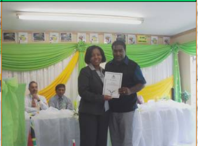
DQA in action