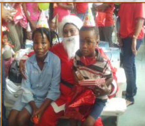
No Christmas without father Christmas.