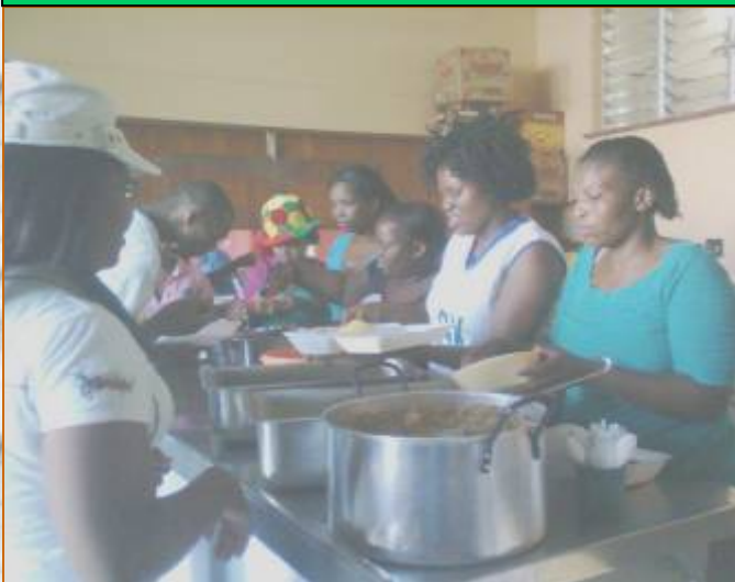
Visitors in the thick of things, Eating delicious dinner.