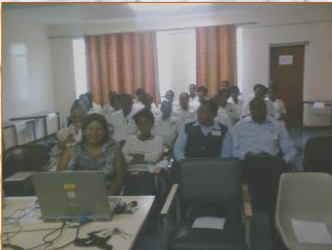
Survey Team attending waiting time presentation

At Osindisweni Hospital we hold clients at heart and to high esteem. We always willing to take their inputs and ideas into consideration.