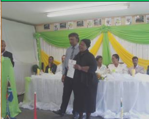
Awards from CEO