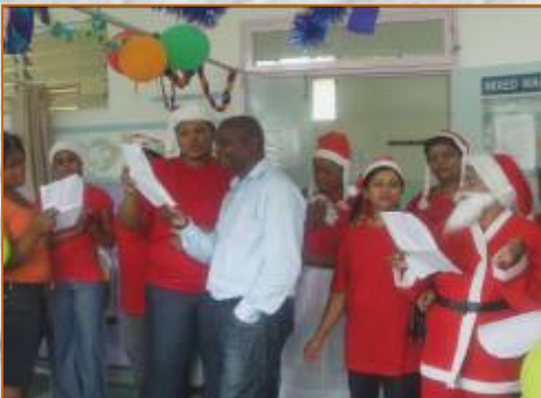
PRO singing in the mix of father Christmas.

Management and staff of Osin-disweni appreciated everything that the NPO and CBO are doing for the children of this Hospital.