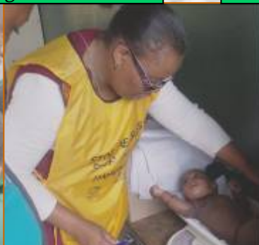
Sr. in-charge in the line of duty.