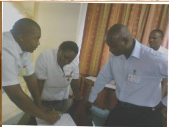
sharing of ideas