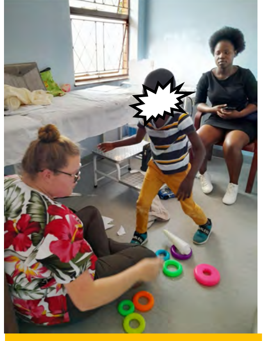
Occupational therapy services at Makhathini clinic .

The first patient attended at Audio therapy department struggling of hearing. The assessment is on progress by the audiologist.