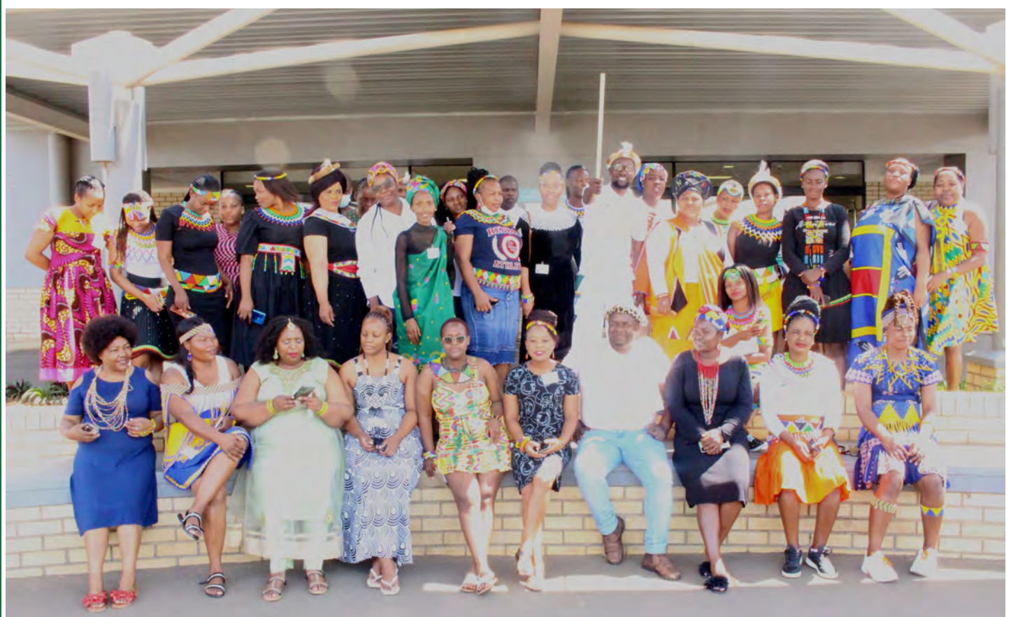
YIBO LABA ABASEBENZI BASO -OTHOBOTHININI CHC BEDLE INQEPHU NGOKWAHLUKAHLUKANA KWEZINHLANGA

akhumbule imvelaphi yabo abasebenzi besikhungo sezempilo Othobothini CHC.