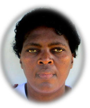
NP MSOMI Professional Nurse