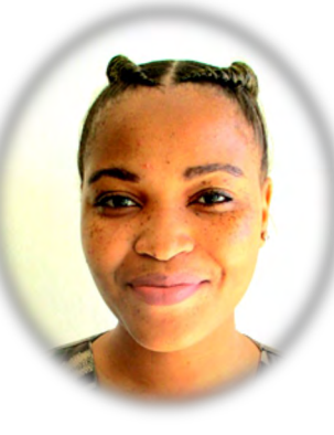
B MORE Pharmacist Comm-serve