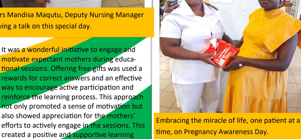
time, on Pregnancy Awareness Day.

Celebrating Pregnancy Awareness Day with compassionate care for expectant mothers.