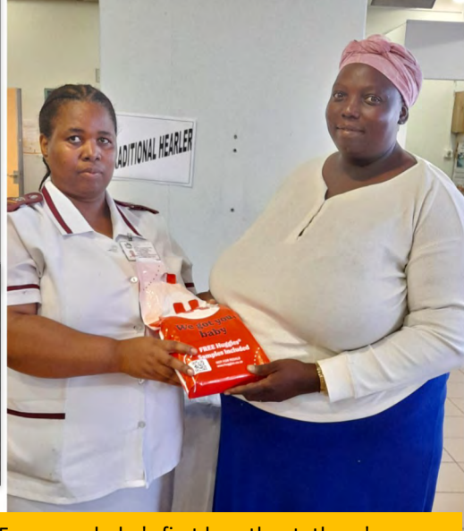
For every baby's first heartbeat, there's a nurse who cares!