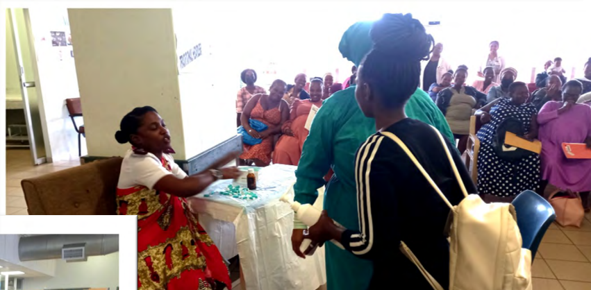
Role Play for the patients to learn all about prenatal care