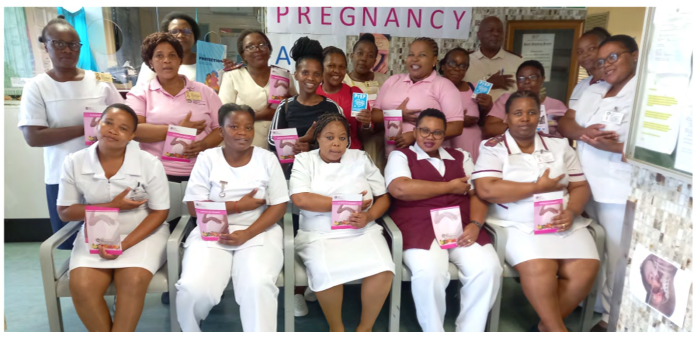
Bringing Prenatal Education to Life: Join our nurses for interactive session as they take the initiative to educate the patients and the community at large during Pregnancy Awareness Week