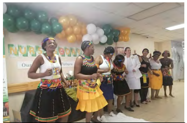
Traditional dance performed by GOPD team members