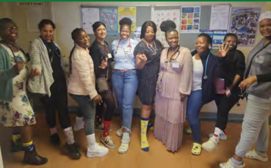
Doctors from Neonatal Unit wearing crazy socks

Friday June 2 was commemorated as Crazysocks4docs Day. QNRH doctor, supported by other staff categories, participated in wearing crazy socks on the day at work. The aim was to raise awareness about mental health in health care workers, and also removing the stigma associated with it.