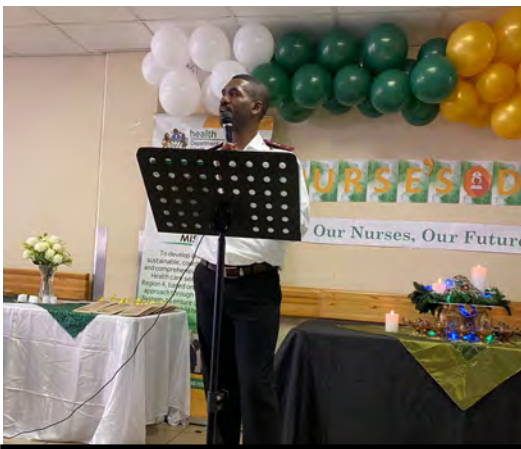
Guest Speaker (..... Delivering his address to nurses