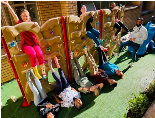
Doctors from Pediatrics Unit enjoying the day at a play center for children