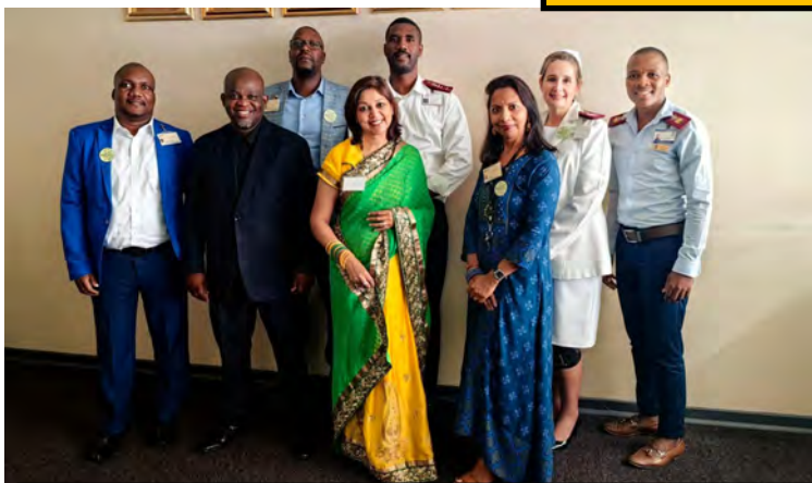
Management team together with guests