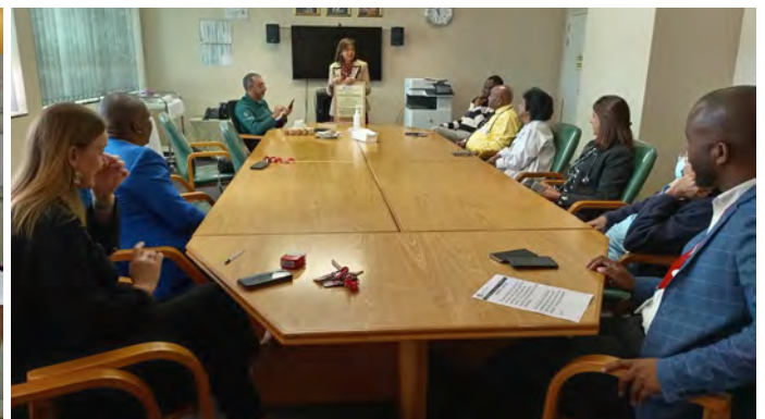
Briefing with the management team and senior managers and clinicians.