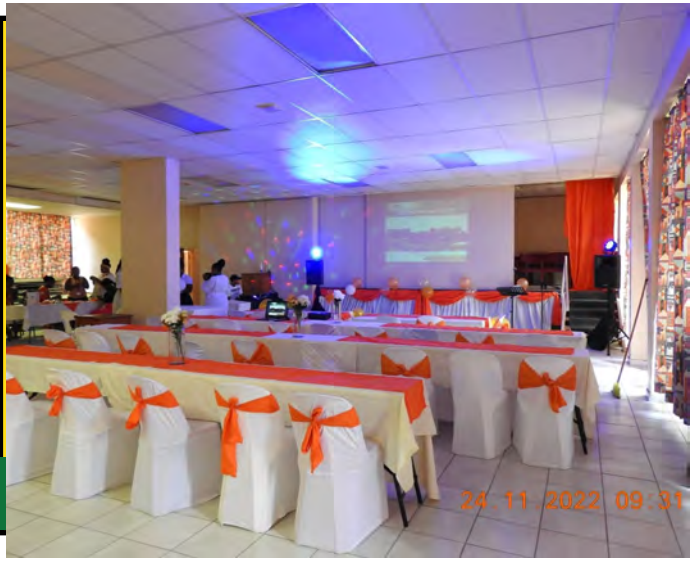
Nurses Residence Hall was transformed "orange" to fit the official theme color fo Quality Day.