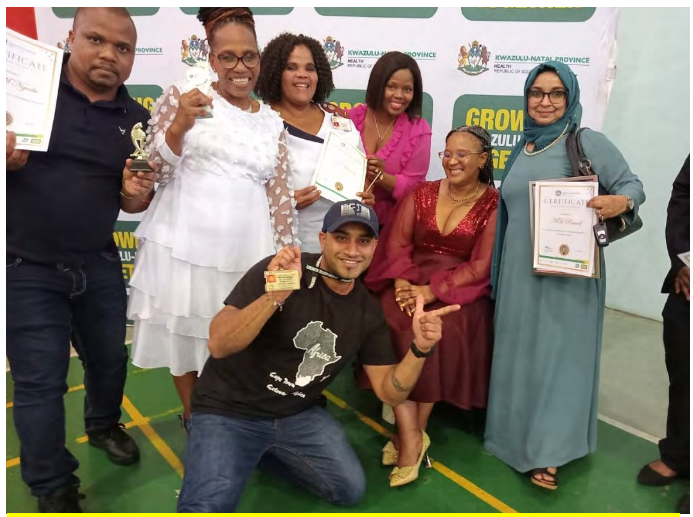
It was celebrations all around at the Staff Awards Day.

The Covid-19 pandemic robbed facilities of the opportunity of acknowledging staff well done. Just when things were getting back to "normal", facilities were hit hard by the looting and soon after, by the floods. What remained constant throughout all the hard knocks that had been dealt with as a country, was the spirit of resilience from healthcare workers who had to step up and ensure that patient care was never compromised.