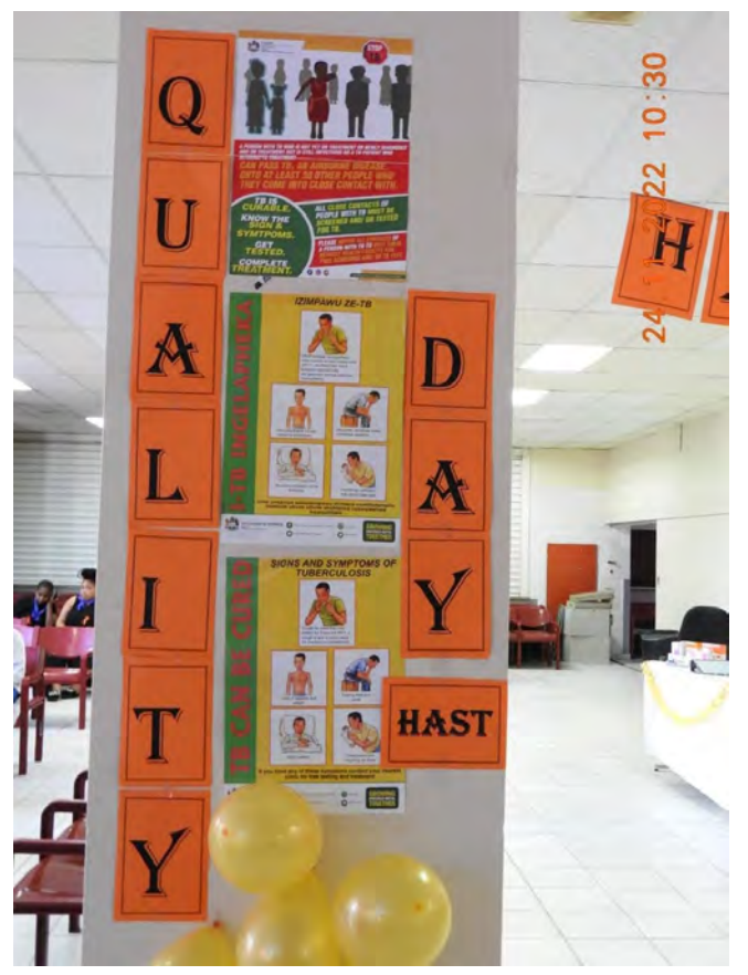
The Hast Team's project for Quality Day was : Improving poor uptake of U-lan