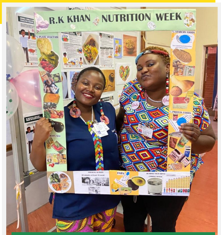
Dietetics Department led the way on sharing information on the importance of correct nutrition.

Occupational Health Clinic took part in raising awareness about the importance of healthy nutrition.