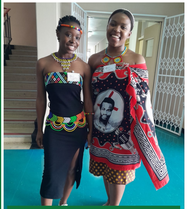
Student Interns looking good in their traditional Zulu & Swati attire.