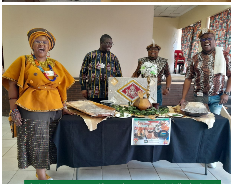
Senior Management team and Systems Component shared a buffet of traditional