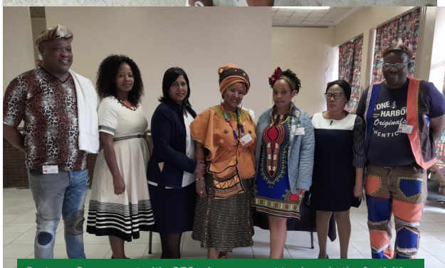
Systems Component with CEO also came out to share in the festivities of the day