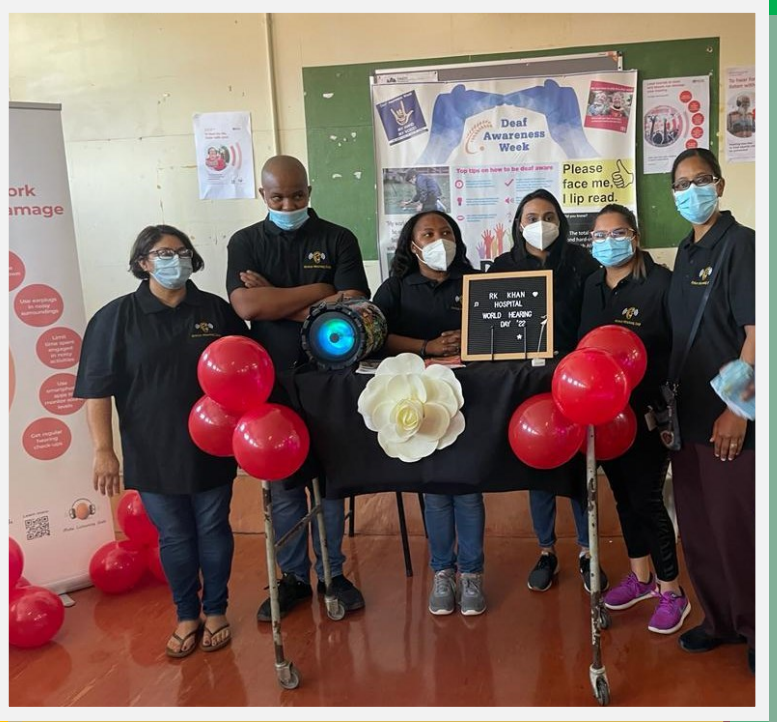
ENT team sharing with mums in POPD on how to identify possible hearing problems in children.