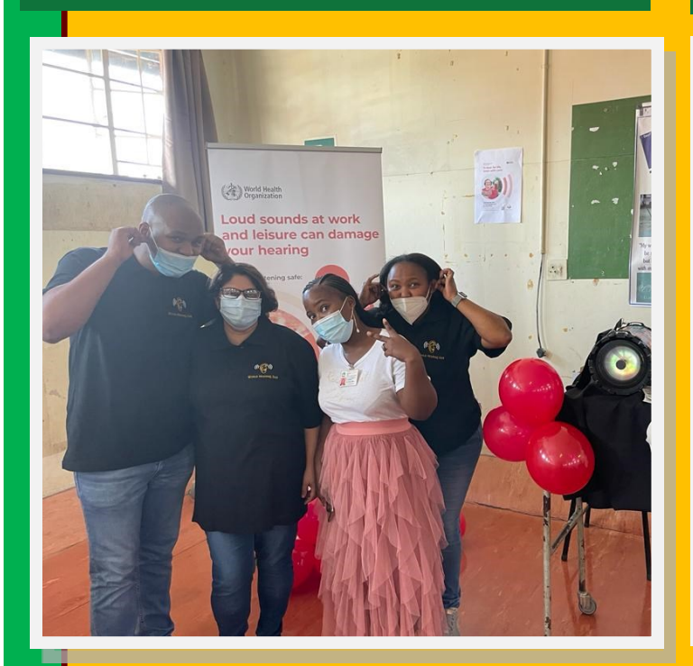
ENT teamed up with Audiology to give advise and ways to prevent hearing loss to patients in OPD.