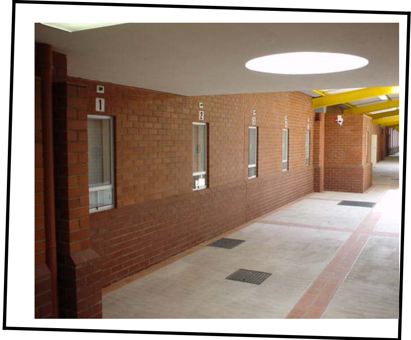
PATIENT WAITING AREA NEW PHARMACY

LOG ON TO THE INTRANET FOR PATIENT INFORMATION