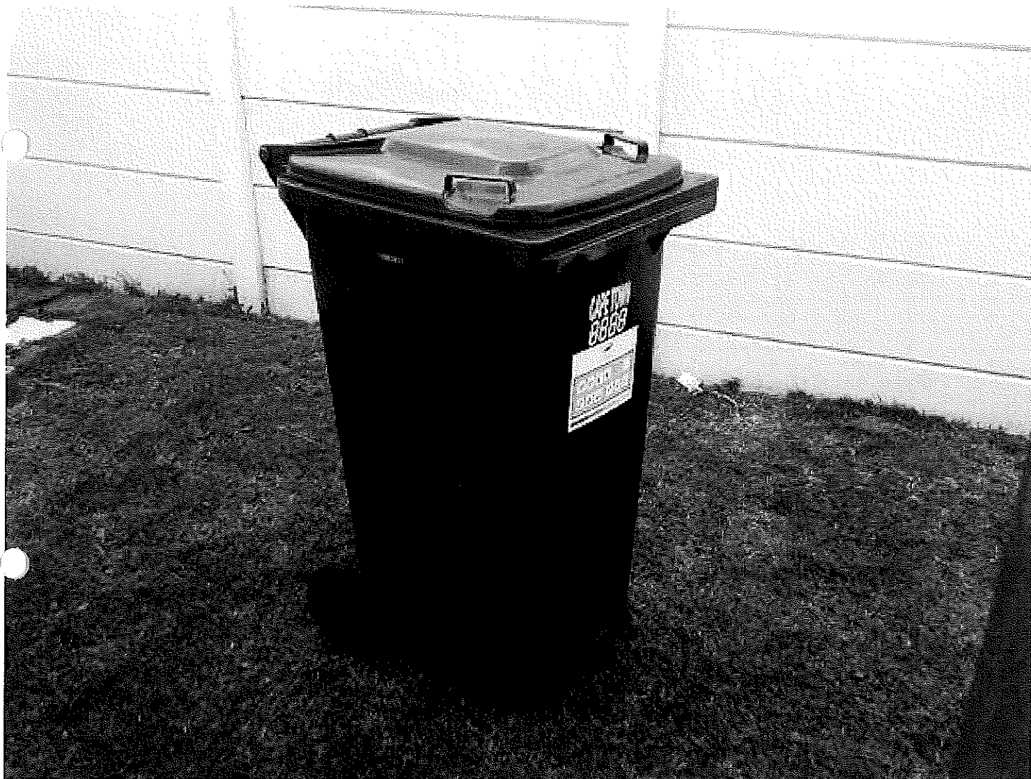
WHEELIE WASTE BINS