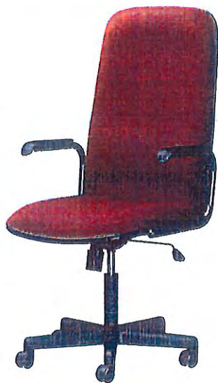
High Back Chair..