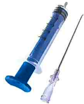
Guide Wire Syringe with Straight Introducer Needle Item Code # 3063G