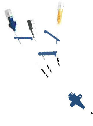
Triple Lumen CVC Item Code # 3063