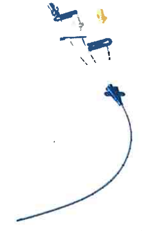
Antimicrobial Coated Item Code # 3063C