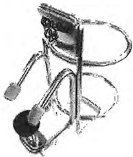
For tables, etc DM050HOLDCLAMP