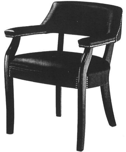
Judges Visitors Leather