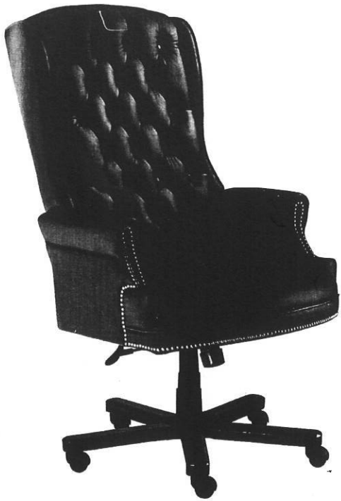
Judges Highback Leather