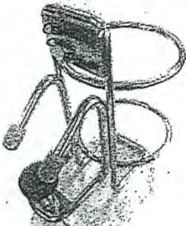
For tables, etc DM050HOLDCLAMP