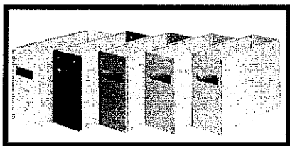
Figure 1: Solid A4 Plastic Colour-coded Containers and Specifications

Solid A4 plastic colour-coded containers are required. As indicated above, each of the openings should accommodate eight (8) containers that will be used to file patient folders. Each container will accommodate seventeen (17) patient A4 folders.