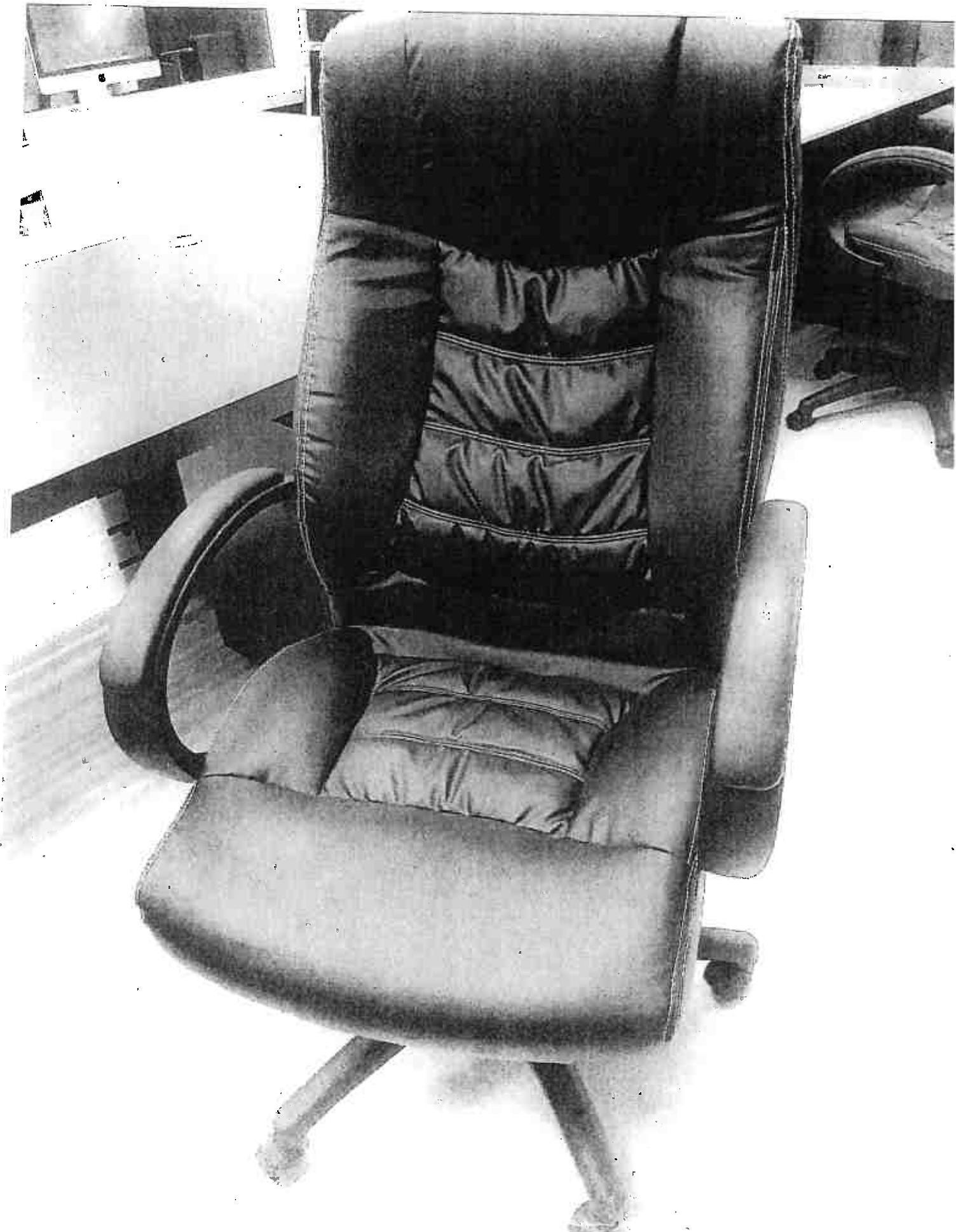
BLACK LEATHER SWIVEL CHAIR