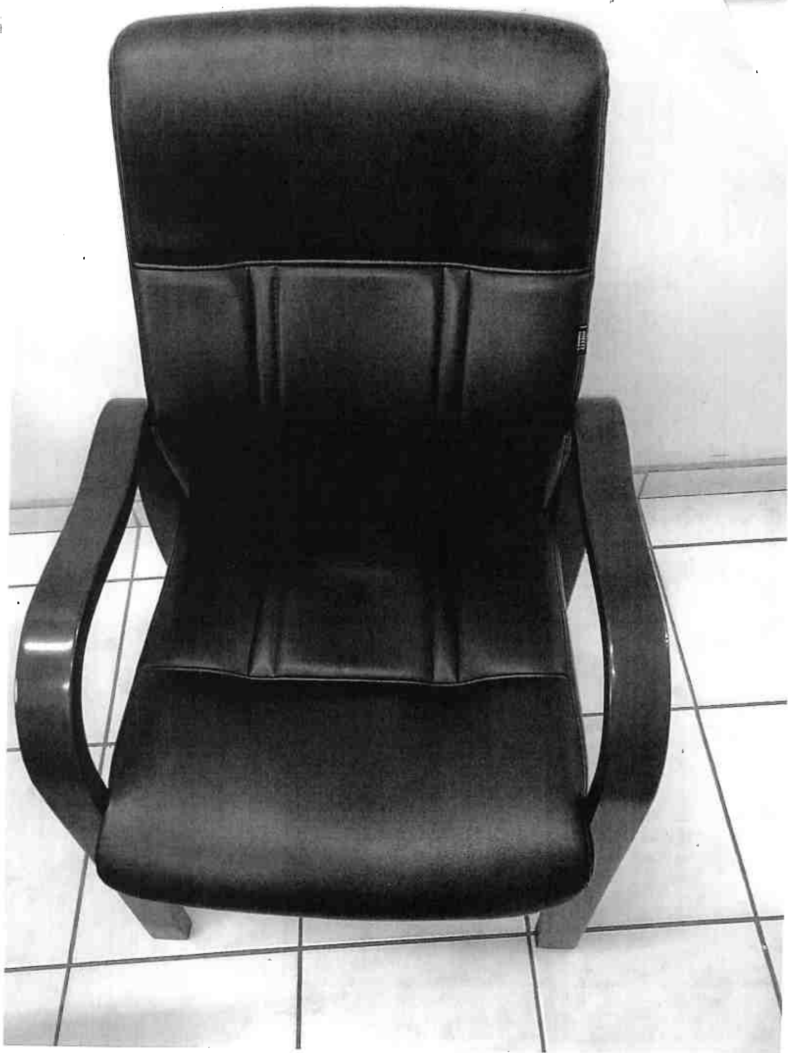
mini BOARD ROOM CHAIRS