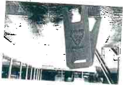
WFS0001 WET FLOOR A FRAME SIGN

LDP0002 LOBBY BROOM FOR DUST PAN WITH COVER LDP0001 LOBBY DUST PAN WITH COVER 870 x 280 x 280mm