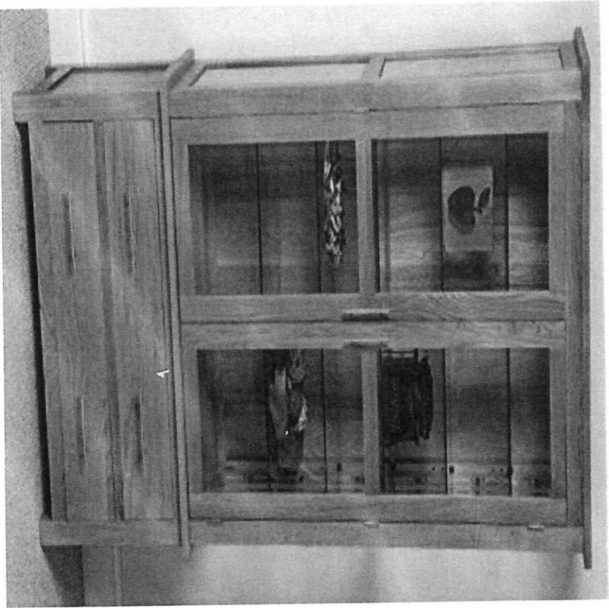
Solid Oak And Glass Display Cabinet, (90 x 40 x 185 cm)