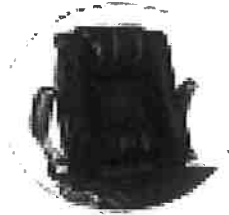
Perfect Neck & Lumbar Support