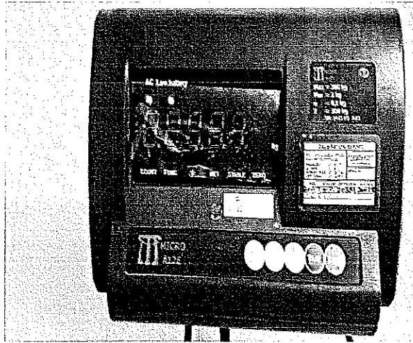
Figure 1: Body Scale Display