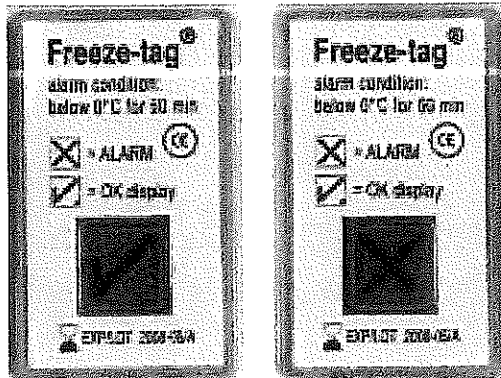
Freeze Indicator (0°C) Model Freeze-Tag