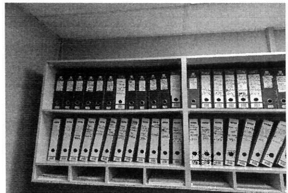
Item No13 Wooden Filing Cabinet