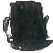
Perfect Neck & Lumbar Support