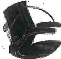
Flip up Armrests