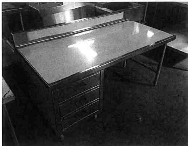
Figure 2: Typical Stainless Steel Table/Desk