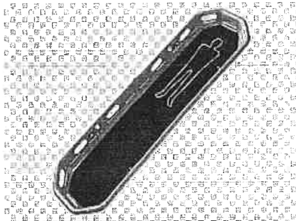
Figure 1: Typical Basket Stretcher

See figure below for typical basket stretcher