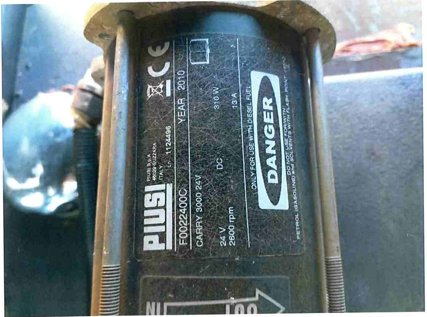
Diesel TANK pump