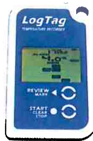
Log Tag® TRID30-7

Fridge tag: is a temperature indicator for refrigerators that shows exposures to temperatures beyond assigned alarm settings. As long as the temperature is within the allowed range, the OK sign is shown on the display. If the indicator is exposed to an out-of-range temperature the ALARM sign appears on the display. The device shows the actual temperature, all alarm violations over the previous 30 days (on a rolling basis), the daily minimum and maximum temperature of the last 30 days, and the time duration of any violation.