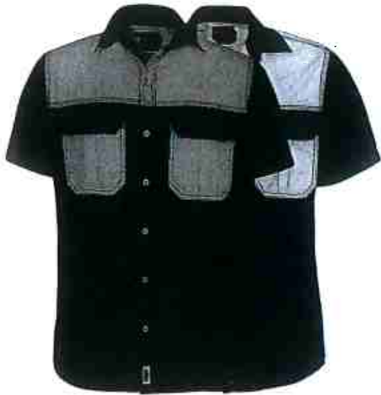
Kalahari & Moss