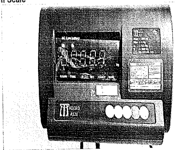
Figure 1: Body Scale Display