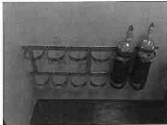
TYPICAL STRUCTURE OF THE WALL MOUNTED OXYGEN BOTTLE