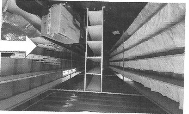
Steel shelving fixed to walls and center rack braced for