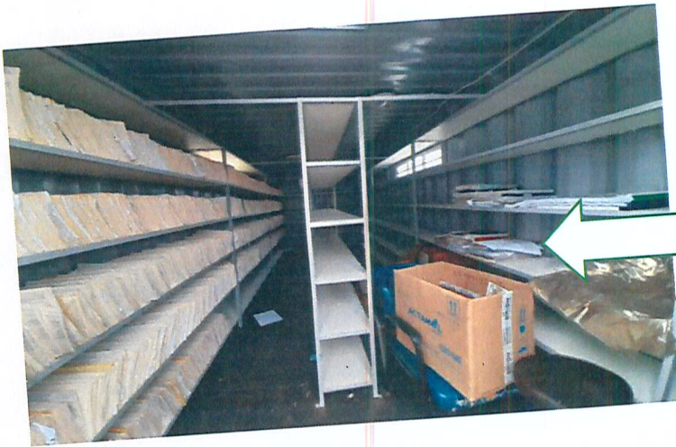
Steel shelving fixed to walls and center rack braced for