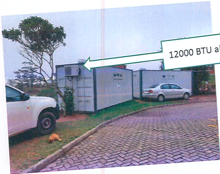
12000 BTU air-conditioned fitted