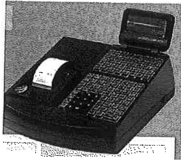
Illustration picture for specification